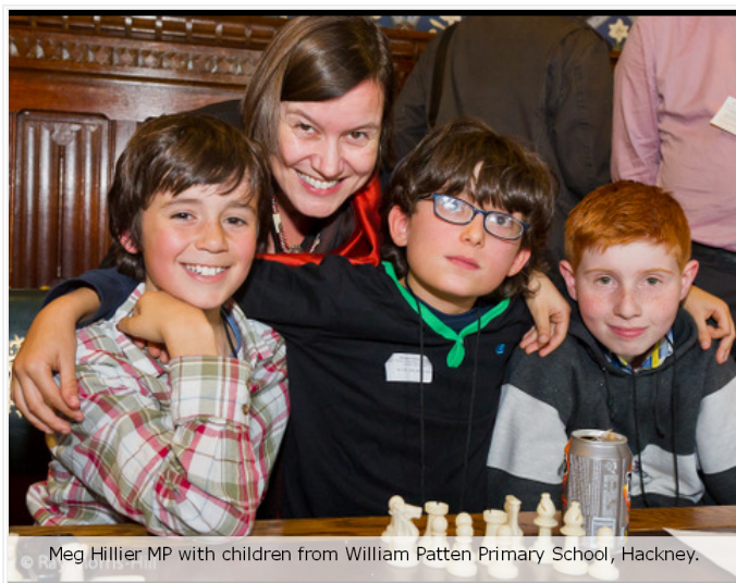
Meg Hillier MP with children from William Patten Primary School, Hackney.