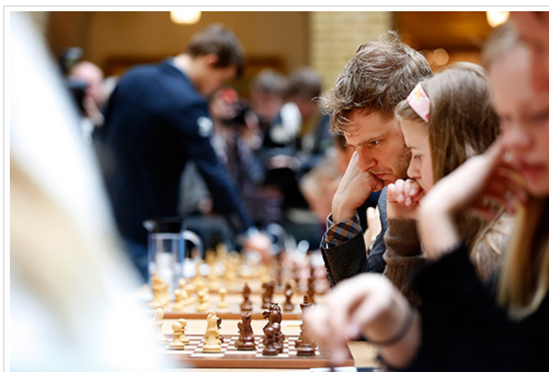
Parents and children teamed up in the simul, allowing both to enjoy the activities

Hosted by the Norwegian Minister of Education, Torbjørn Røe Isaksen, the event with Magnus Carlsen and Garry Kasparov received considerable media attention as well as publicity thanks to the presence of Norway's star, who gave a simul while endorsing the project.