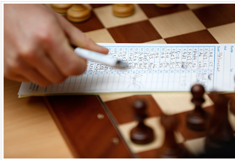
A study in Spain linked chess education to improved mathematical and reading scores

"The Catalan government recently endorsed one of the most recent scientific studies on the educational benefits of chess. Designed by the universities of Girona and Lleida, the report concludes that students who learn chess at school develop their intellect significantly on several levels, and improve their math and reading scores – the two major weak points for Spanish school kids on the Pisa Report, an international student assessment program." - El Pais