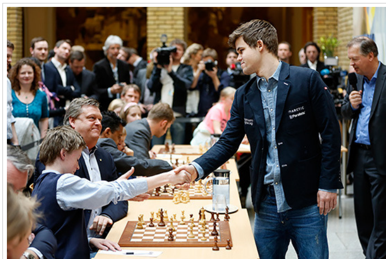
It helped promote a positive atmosphere that would help assuage any doubts