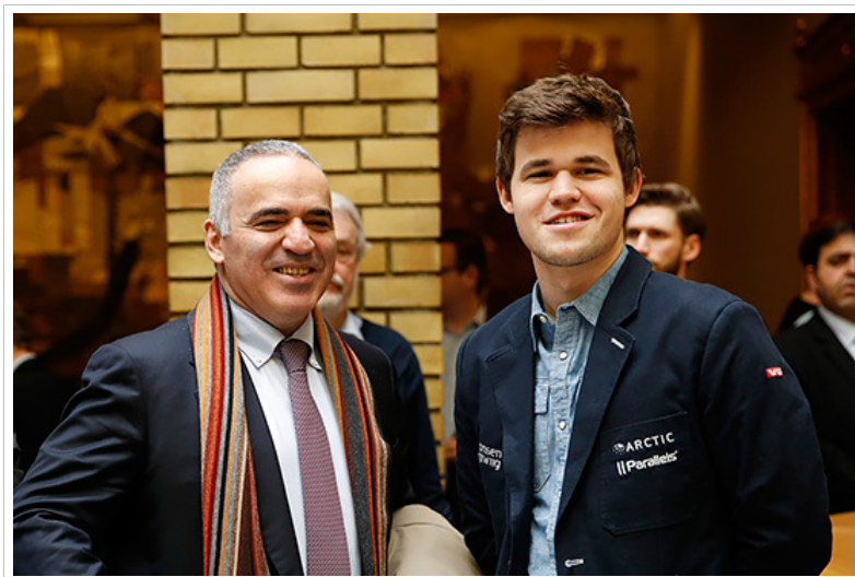
Garry Kasparov and Magnus Carlsen both provided the full weight of their support

The goal was to promote chess in schools in Norway. Specifically, the Norwegian Chess Federation intends to launch a trial where third- or fourth-graders get to have one hour of chess at school each week.